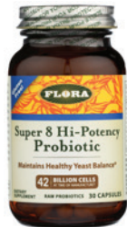
Flora Super 8 Hi-Potency Probiotic

Empowering Extraordinary Health® for 25 years, Garden of Life has been a trusted brand offering innovative organic supplements for the entire family. From delicious proteins to clinically studied probiotics to a wide range of vitamins and minerals, there's a product formula to suit your specific health needs.