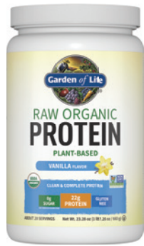
Garden of Life Raw Organic Protein Powder