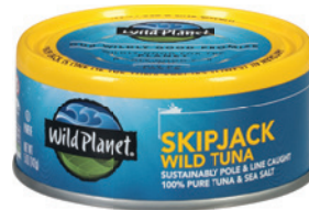
Wild Planet Wild Skipjack Tuna selected varieties

At Wild Planet, we believe that delicious food and sustainability can go hand-in-hand. That's why we source our seafood from sustainable fisheries and use only the highest quality ingredients. Our canned seafood is packed with flavor, nutrients, and protein.