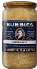
Bubbies Sauerkraut selected varieties

For over 40 years, people have trusted Bubbies for premium fermented and pickled products made using family recipes, time-honored methods, and real ingredients. Only the best comes from Bubbies kitchen.