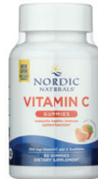
Nordic Naturals Vitamin C Gummies