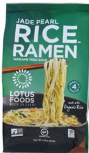
Lotus Foods Rice Ramen selected varieties