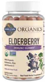
Garden of Life Organic Elderberry Immune Gummy