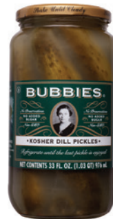
Bubbies Kosher Dill Pickles