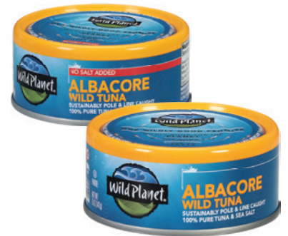
Wild Planet Wild Albacore Tuna selected varieties