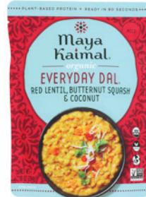
Maya Kaimal Organic Everyday Dal selected varieties