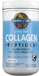
Garden of Life Grass Fed Collagen Peptides